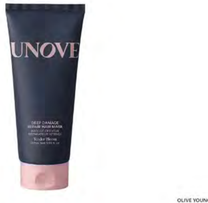
Unove Deep Damage Repair Hair Mask