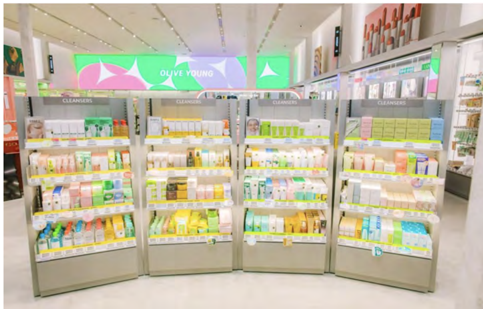
South Korea’s top beauty and lifestyle destination, is making its official debut in the United States.