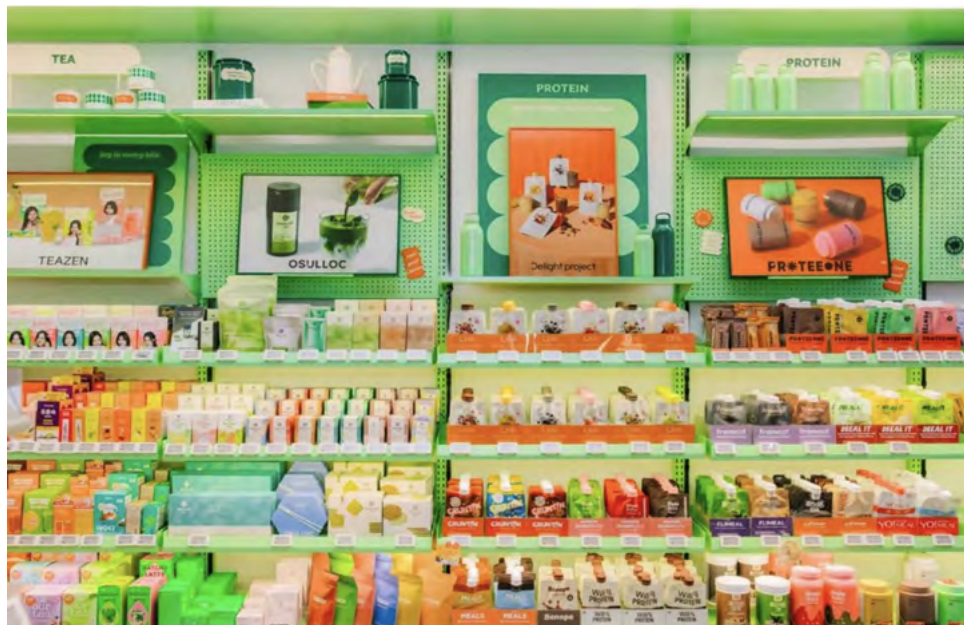
Olive Young is dedicated to skincare, but shelves are also stocked with makeup, fragrance, haircare and more. Olive Young

The new Pasadena outpost, however, is just the beginning of the company’s expansion. Olive Young is slated to open a second location at the Westfield Century City mall in Los Angeles next month. The retailer is also partnering with Sephora this fall to create a “dedicated zone” of K-beauty products online and in stores across the U.S., Canada, Hong Kong, Singapore, Malaysia, and Thailand.