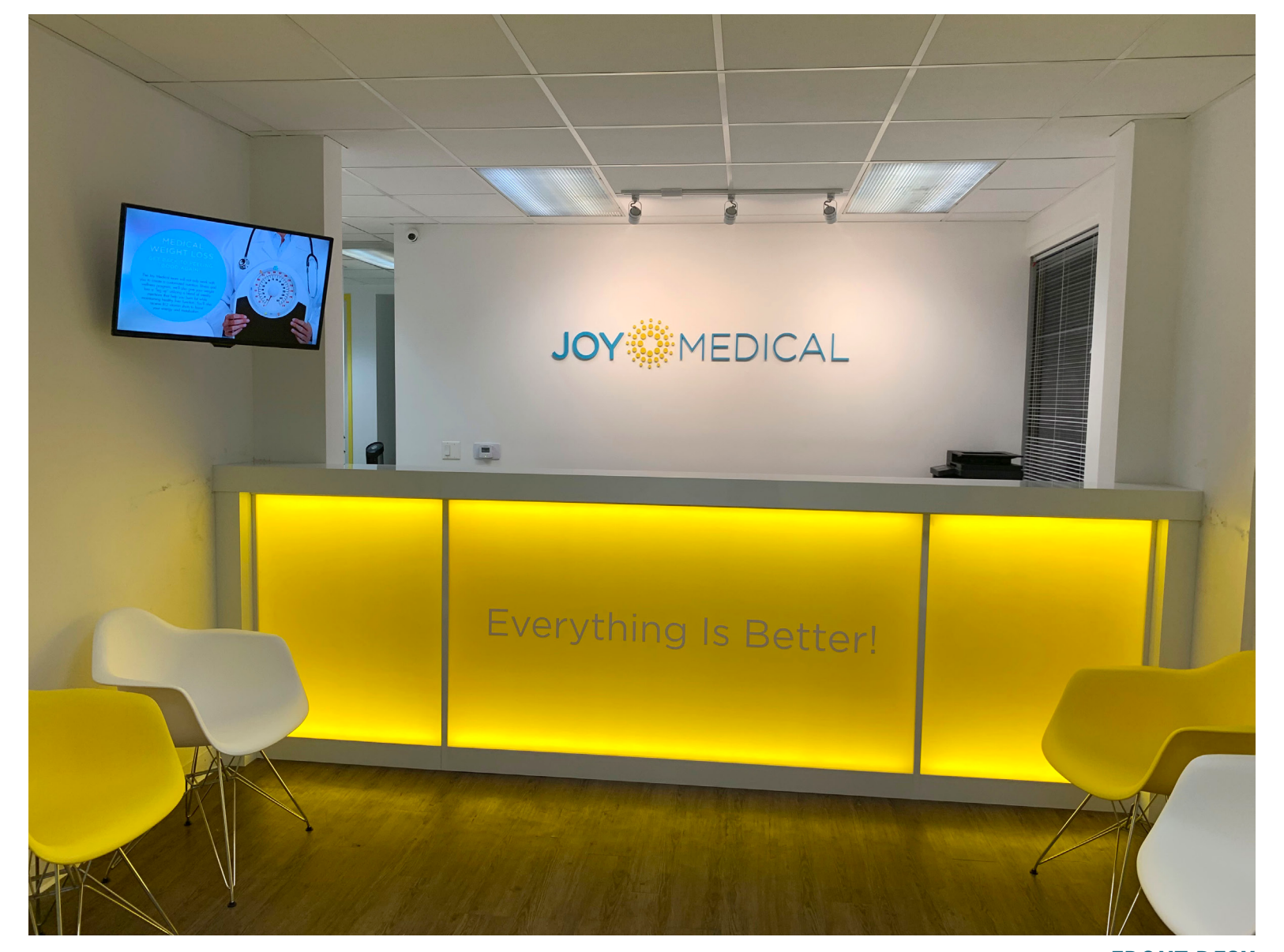
FRONT DESK AFTER