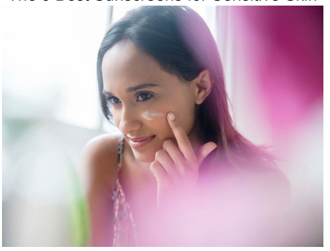
These SPF formulas are gentle enough for even the most sensitive skin types. KATHLEEN MULPETER | April 02, 2018

You diligently slather on SPF to protect yourself from dangerous UV exposure that can lead to skin cancer, as well as prevent dark spots and other signs of aging. So, for those with sensitive skin in particular, it's frustrating when sunscreen has the opposite effect, triggering irritation or redness rather than protecting and improving your complexion.