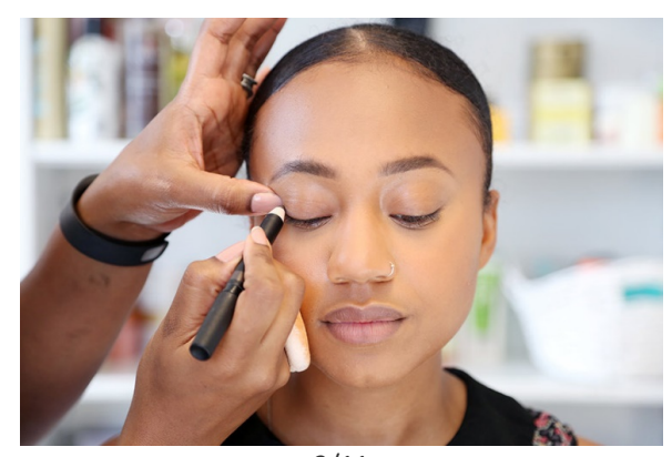
Next, swipe the Nudestix eye pencil ($24, <u>sephora.com</u>) across the lid.