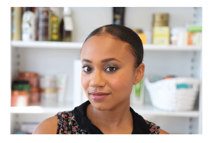
11/11 Shop the entire Nudestix line here!

http://www.essence.com/how/how-to-use-makeup-pencils-nudestix#1015115