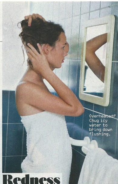
Overheated? Chug icy water to bring down flushing.

...at the derm's office: Since uneven pigment can cover a large area of skin, derms often suggest a combination of prescription drugs (say, a hydroquinone cream with a retinoid) to combat the pigment and reduce inflammation, which can exacerbate splotchiness. For a quicker fix, you may want to consider an in-office glycolic peel. "A dermatologist can tailor the strength of the peel to your skin's individual needs," says Dr. Downie, something you can't do with a DIY version. You'll likely need several treatments, and there's no downtime (save for an hour or so of slight redness). For more severe pigmentation issues, you can go with a fractionated laser such as Fraxel that "punches microscopic holes into the skin, which, when they heal over about three to four days, obliterate spots and increase collagen production," explains Dr. Zeichner. You'll typically need three to five treatments spaced every two to four weeks, at a cost of about $1,000 and up per session.