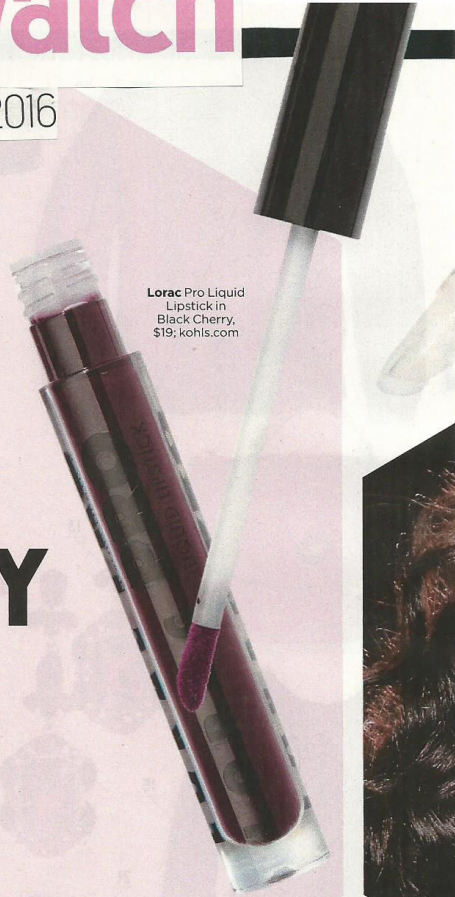
Lorac Pro Liquid Lipstick in Black Cherry, $19; kohls.com

The forecast for fall? Glam, pretty and cool! Pick whichever suits you best and get primpin'