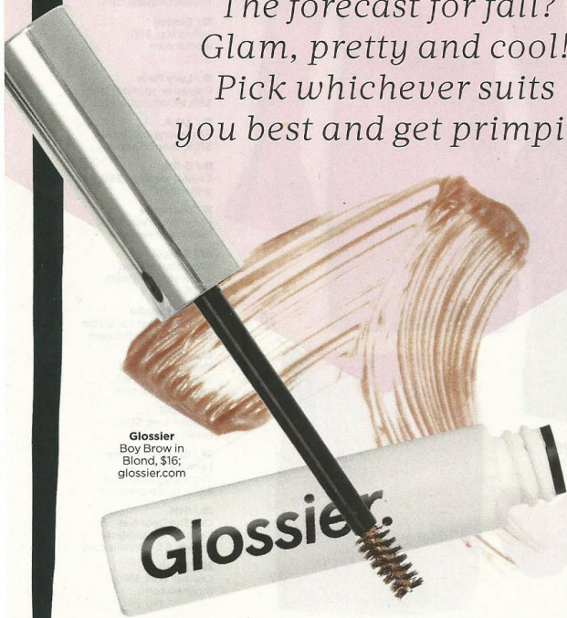
Glossier Boy Brow in Blond, $16; glossier.com